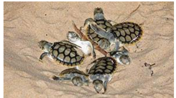
Flatback turtle hatchlings