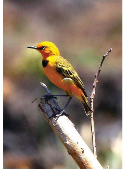
Yellow chat