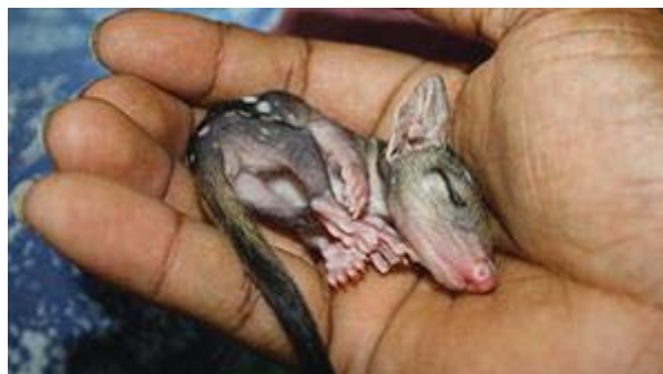
Northern quoll joey