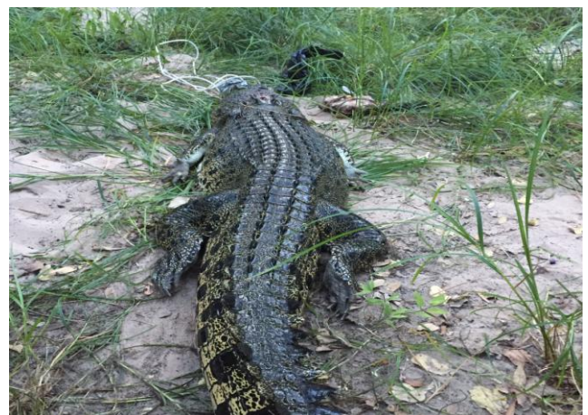
Maguk: 3.9m male 19 April 2016