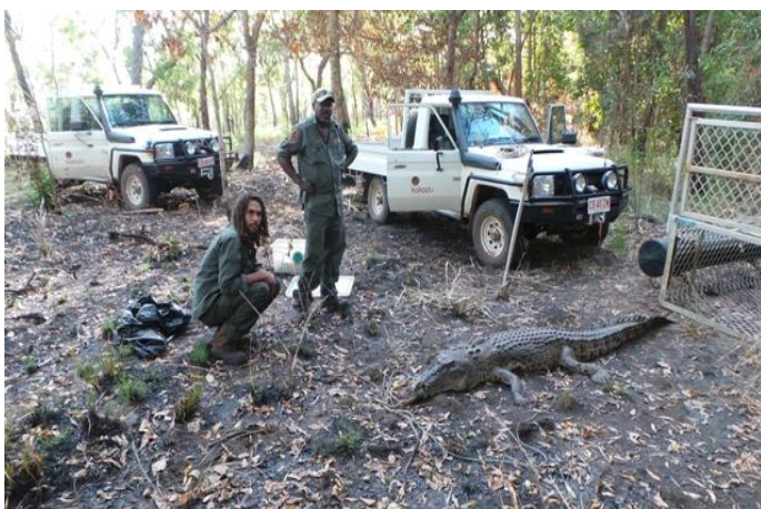
Gubarra: 2.98m male, removed 16 October 2014