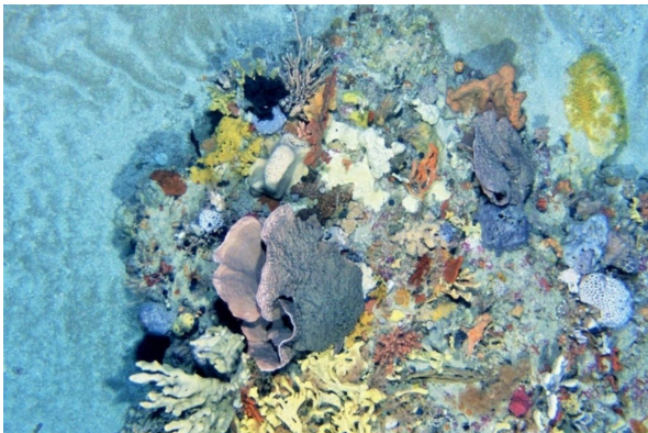
Beagle Marine Park (Institute for Marine and Antarctic Studies)