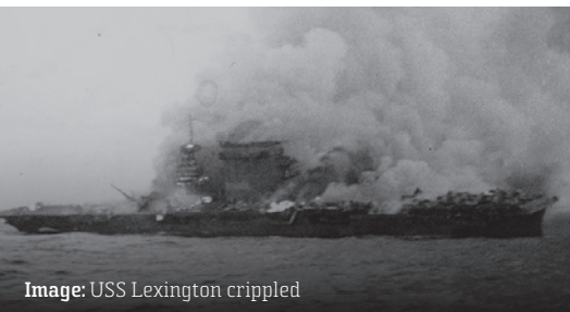
Image: USS Lexington crippled

Archaeologists from the National Maritime Museum and the Silentworld Foundation recently visited Kenn Reefs, a treacherous area for navigation in the Coral Sea, 520 km north-east of Bundaberg. They discovered three previously unknown shipwrecks, estimated to be at least 150 years old. These ships were probably trading vessels, wrecked on their way from Australia to Asia or as far away as Europe.