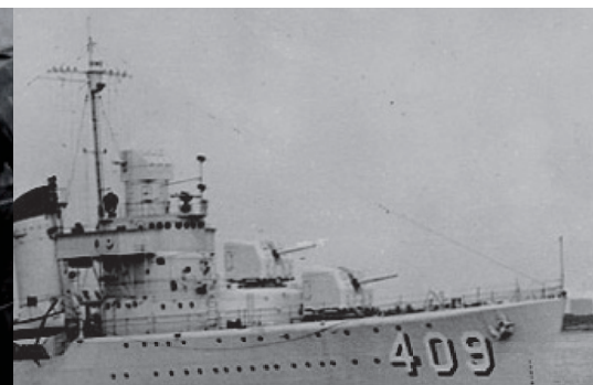
Image: USS Sims, destroyer