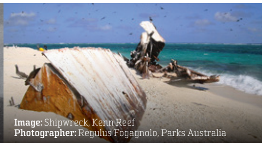
Image: Shipwreck, Kenn Reef