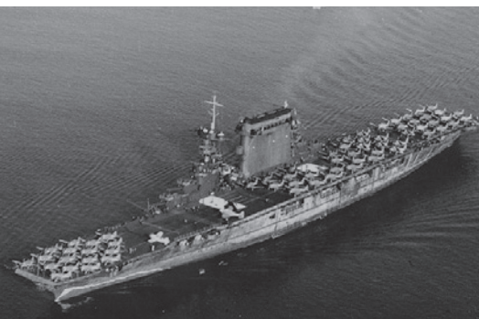
Image: USS Lexington, October 1941

sunk during the Battle of the Coral Sea lie up to 3 km underwater in what is now the Coral Sea Marine Park.