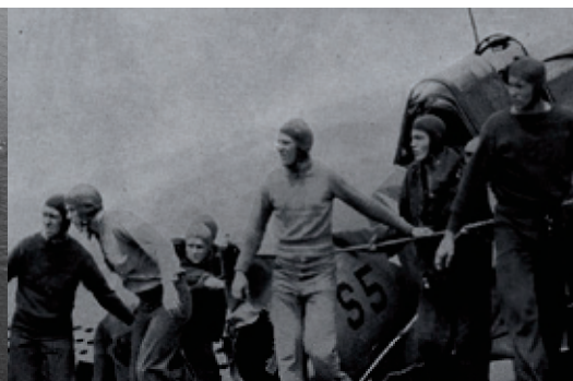
Image: USN flight deck crew