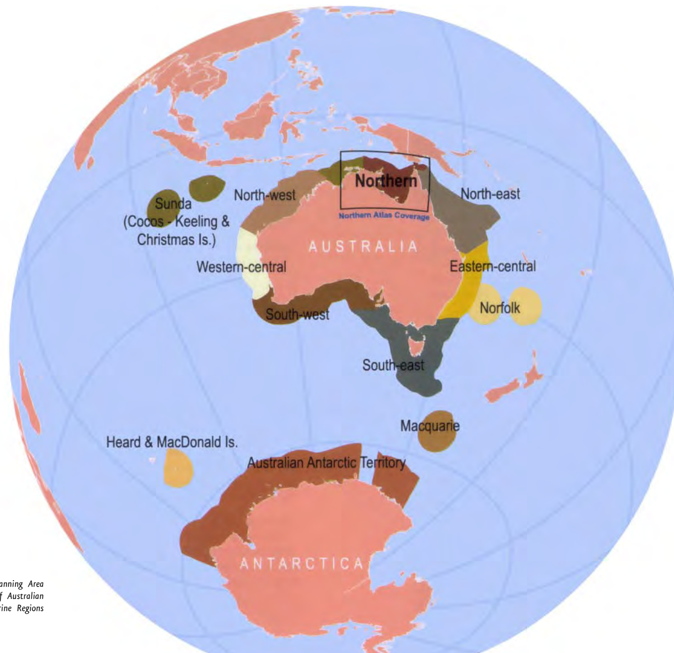
Figure 1: Northern Planning Area in the context of Australian Marine Regions

The Australian Marine Regions identified in Figure 1 have been based on large marine ecosystems within Australia's marine jurisdiction and do not specifically relate to jurisdictional or necessarily to regional marine planning boundaries.