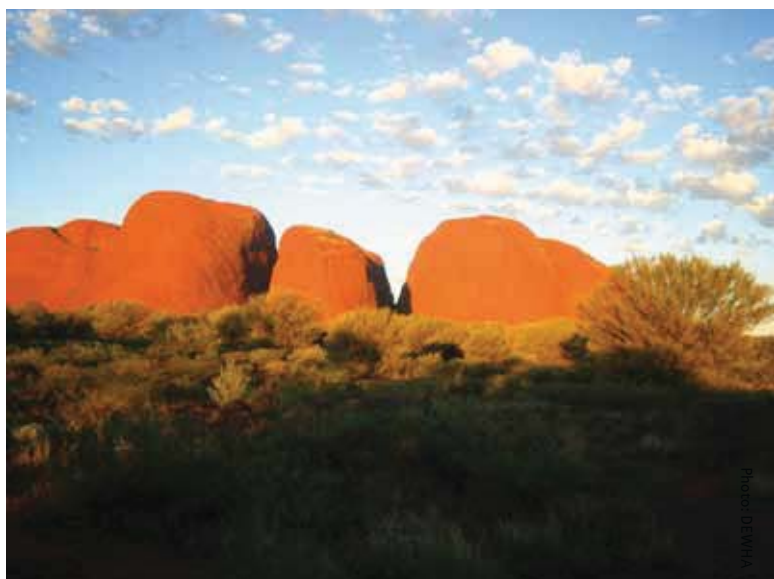
*Sunset at Kata Tjuta Sunset Viewing (*see page 26)